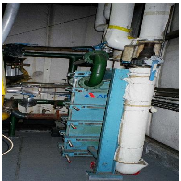
Figure 3: Recovered Heat System