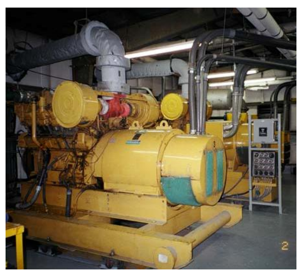
Figure 1: Angoon Power Plant

905 Plum St SE, Bldg 4 • P.O. Box 43165 • Olympia, WA 98504-3165 (360) 956-2004 Cooperating agencies: Washington State University Energy Program, U.S. Department of Energy, Alaska Energy Authority, Idaho Department of Water Resources Energy Division,