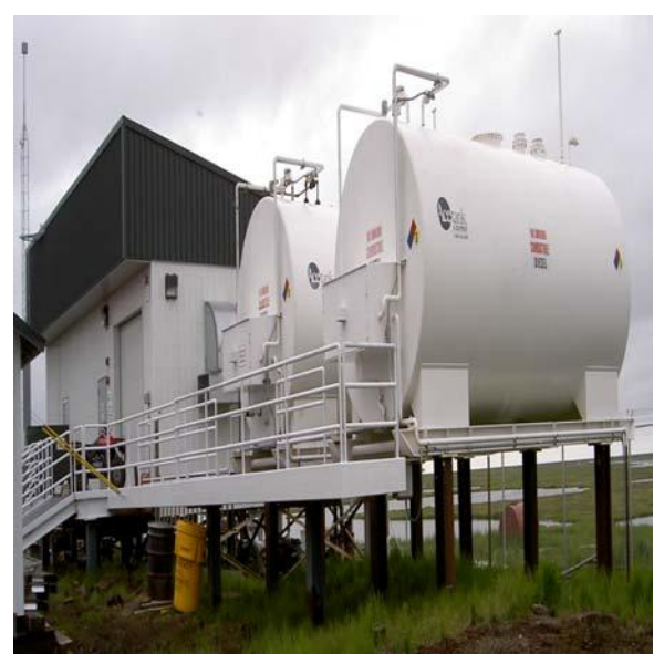
Figure 1: Kongiganak Power Plant