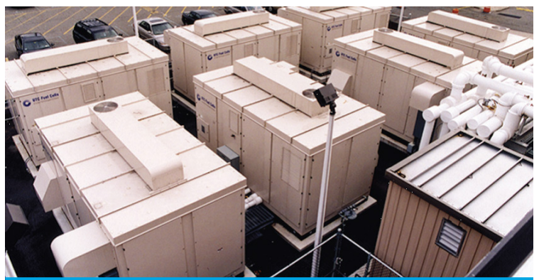
CHP fuel cell installation at Verizon data center.<sup>1</sup>